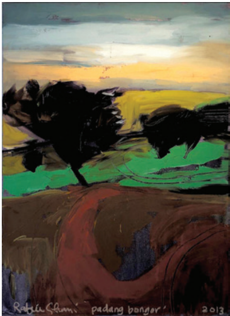
Rafiee Ghani , 2013 Padang Bongor , Oil on canvas, 92cm x 153cm