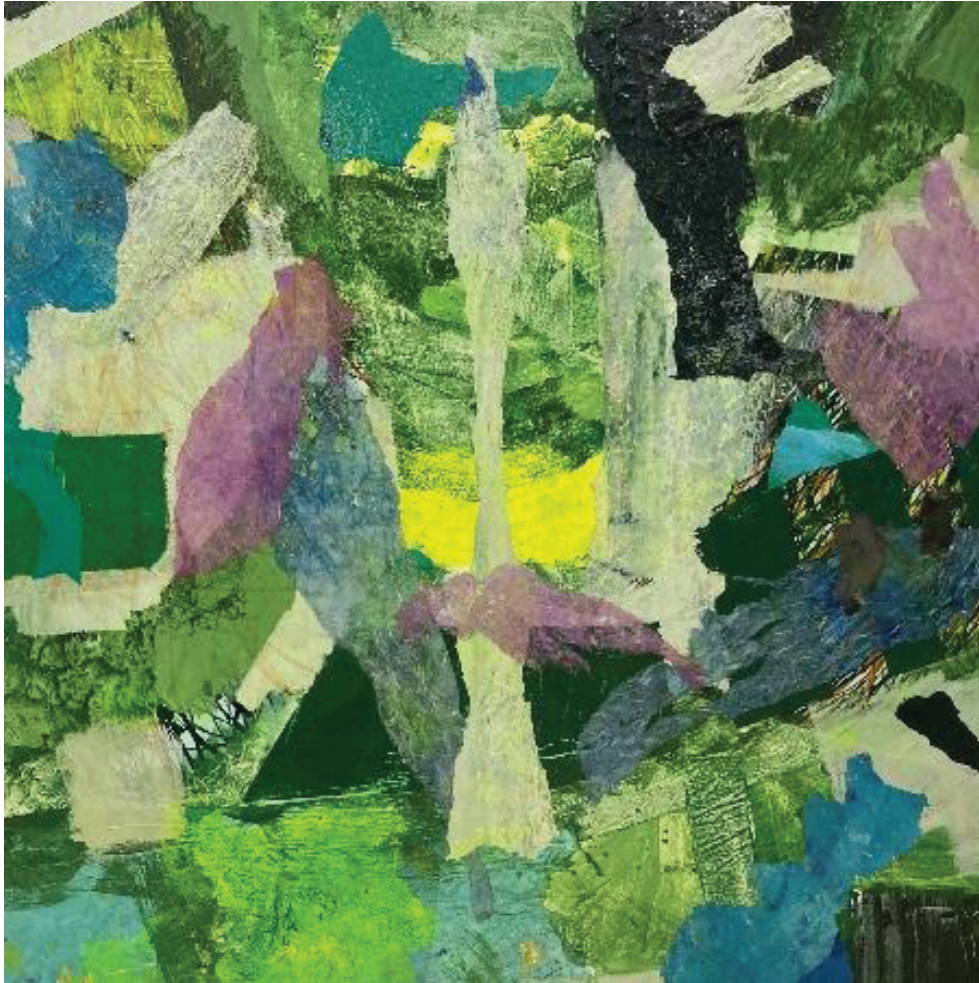
Khalil Muhsain, 2021 Grass Fragrance , Collage and Acrylic on canvas, 105.5cm x 105.5cm