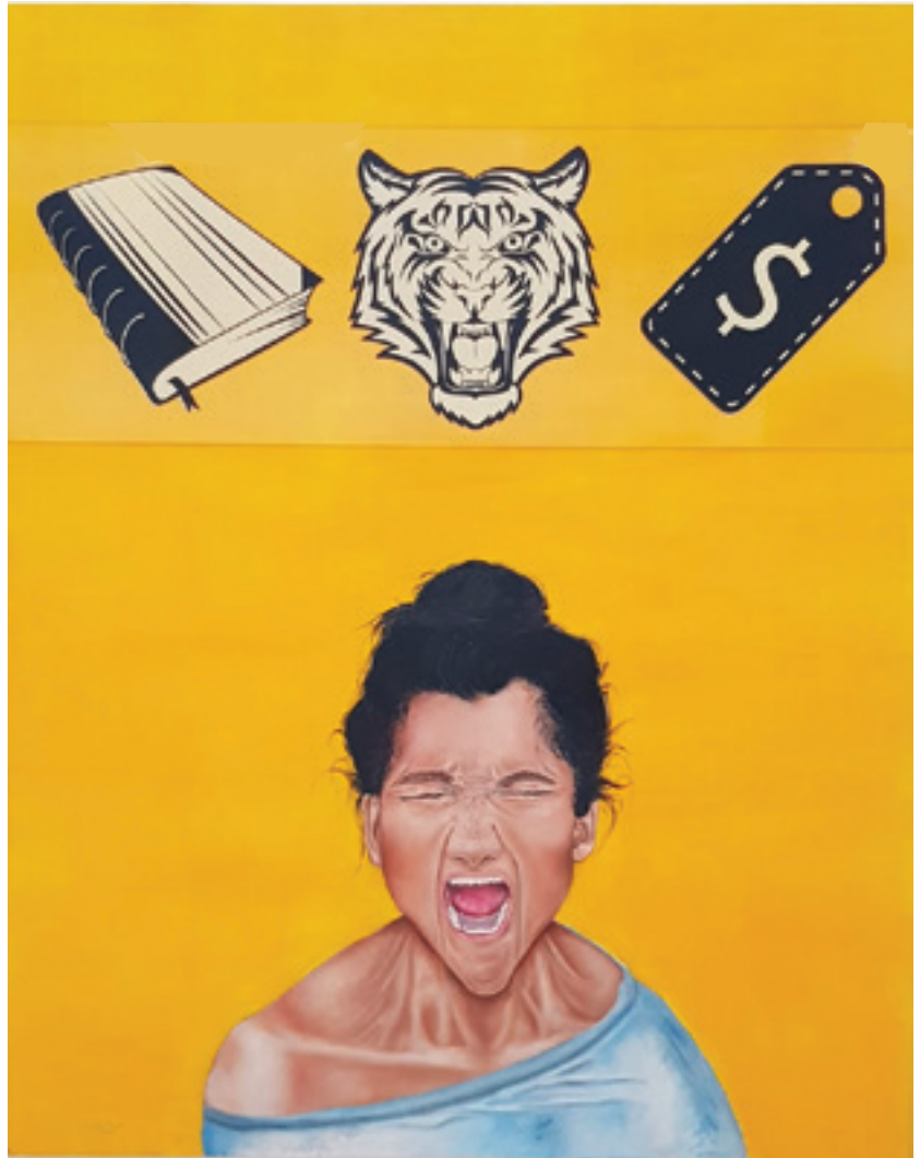
Poojitha Menon , 2020 Eve's War , Mixed Media, 122cm x 148cm