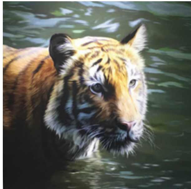
Rachel Gray, Perch , Digital art on canvas, 64cm x 64cm