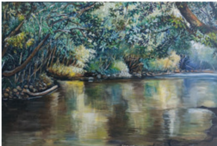
Meriam Omar, 2011 Serene , Acrylic on canvas, 132cm x 86.5cm