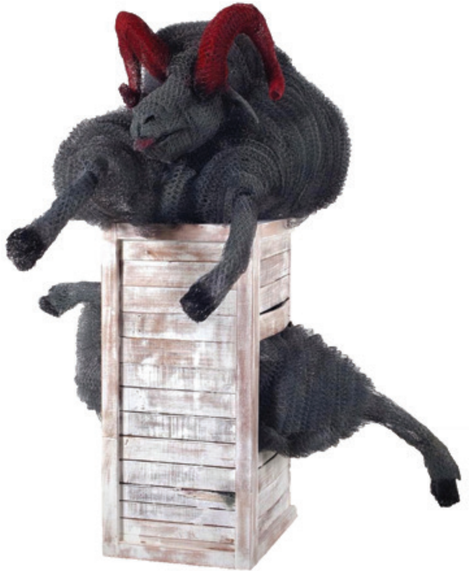
Jamil Zakaria, 2016 Kambing Import , Chicken wire and wood