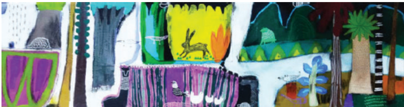
Elly Nor Suria, 2021 Pukul berape Datuk Harimau? , Mixed Media, dyptych 45cm x 150cm (each),