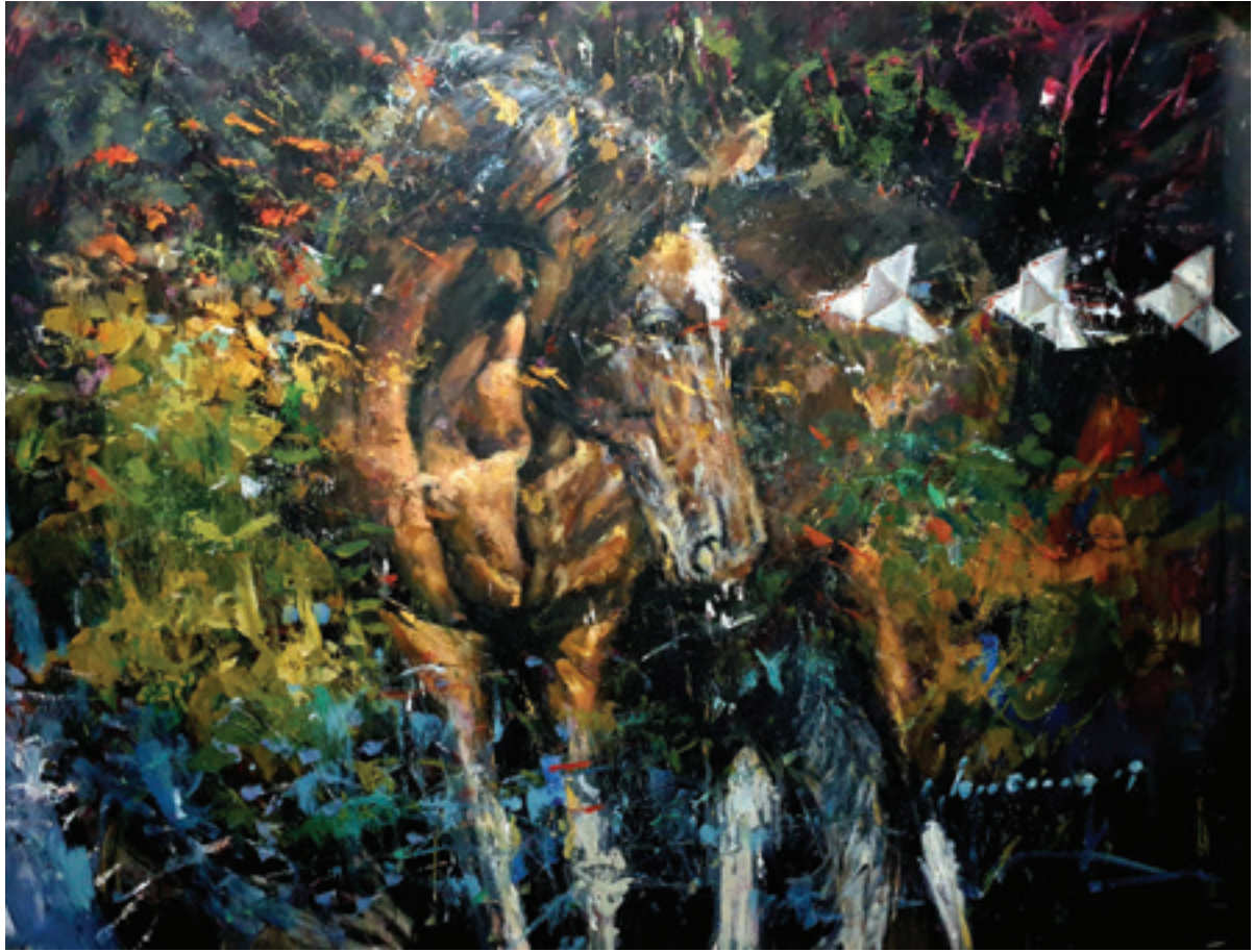
Ben Chong See Wai , 2019

Optimism series : Sequencing , Acrylic on canvas, 170cm x 140cm