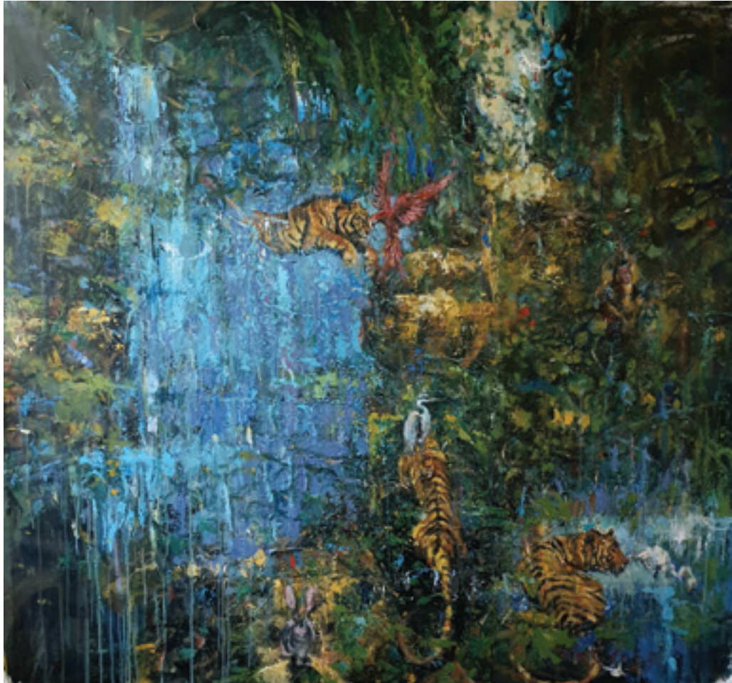
Ben Chong See Wai , 2020

Optimism series: Harmony , Acrylic on canvas, 138cm x 138cm