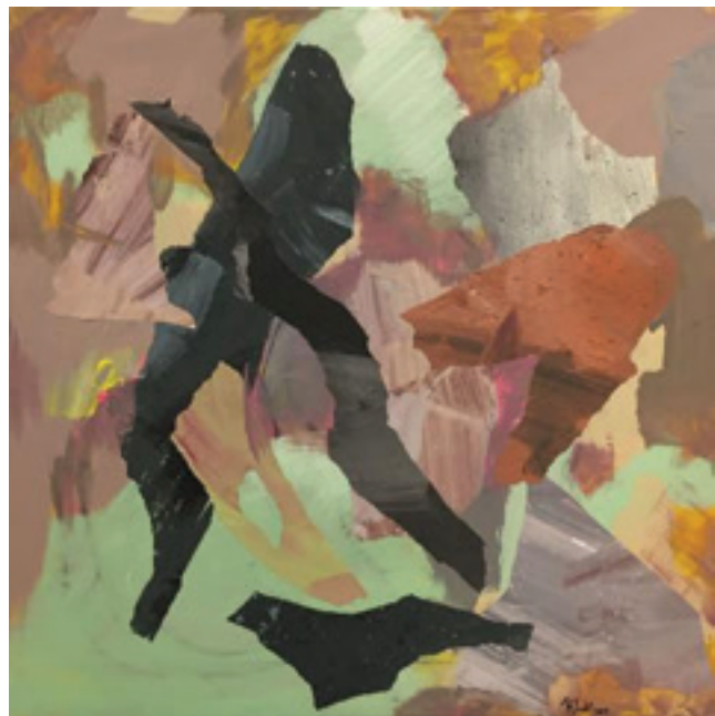
Khalil Muhsain, 2019 Jungle Landscapes Series #1 , Mixed Media on canvas, 61cm x 61cm